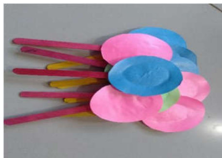
Figure 3. Step 3 in making multiplication wheel media