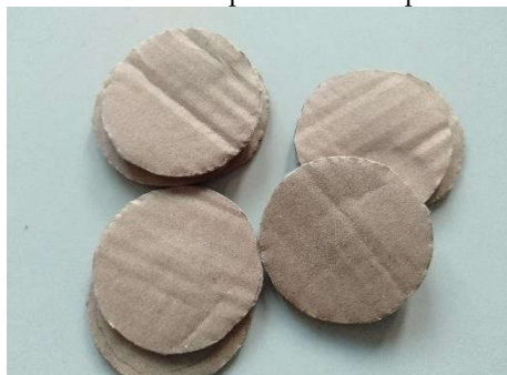
Figure 2. Step 2 in making multiplication wheel media