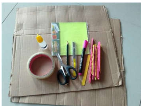
Figure 1. Step 1 in making multiplication wheel media