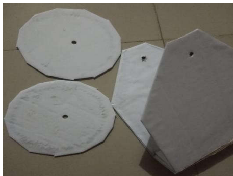
Figure 5. Step 5 in making multiplication wheel media