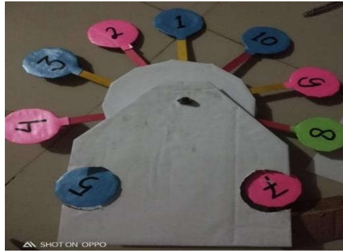
Figure 7. Step 7 in making multiplication wheel media

The steps for using the multiplication wheel learning media are: