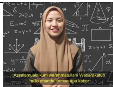
Figure 2. Initial View

Third, the development stage. The following is the development stage for making learning media using the Sparkol Videoscribe application. After the interactive learning media using Sparkol Videoscribe on the limit material of the algebraic function has been revised based on the validator's suggestions, while the result of the validation assessment is obtained the percentage of media and material can be seen in Table 5.